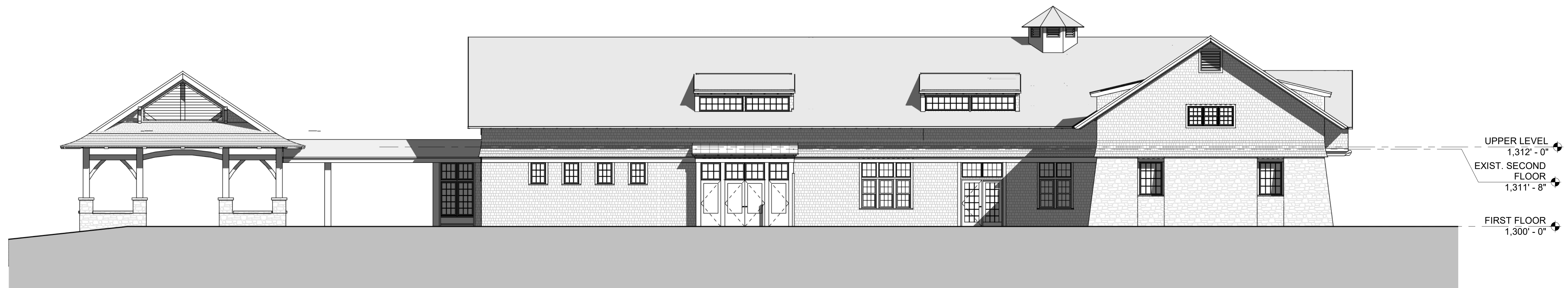
1 SOUTH ELEVATION. Scale: 1/8" = 1'-0"